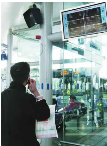
Horsham bus station real-time information screen.

This year Passenger Focus, the independent passenger watchdog, carried out its first Bus Passenger Survey on Metrobus. We were encouraged to discover that 93% of our passengers surveyed were satisfied with our services. The survey does not mean we can relax our efforts but it gives us a benchmark for the future.