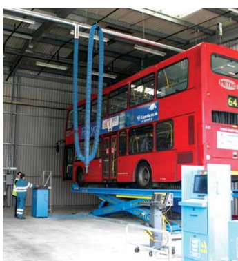
Buses are fitted with an engine idle shut down system to reduce emissions and noise pollution.

We continue to work to reduce our environmental impact both in our depots and from our buses on the road. We have reduced CO 2 per passenger journey by 1.64%.