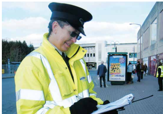
A safe and secure environment for passengers is a high priority.

We meet regularly with local police in relation to issues affecting bus performance such as illegal parking and anti-social behaviour. Our drivers are encouraged to report such incidents with details being passed onto the police for further investigation and action.