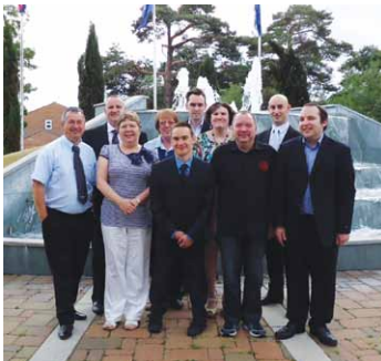
The Crawley Action Group and Metrobus staff who were involved in the Disability film.

We have worked closely with local authorities, planners and developers for Section 106 funding to be used for the benefit of local passengers. Section 106 funds have helped in schemes to pay for installing bus shelters and real-time screens, through to delivering complimentary tickets to households on new estates in order to acquaint them with the availability of the local bus service.