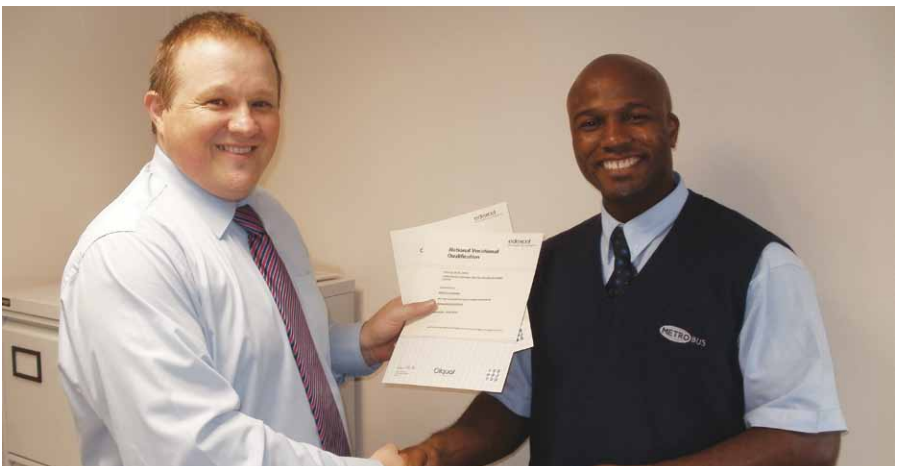
Metrobus driver receiving his NVQ certificate.

We recognise Unite the Union and regularly consult with staff representatives and full-time officers over all aspects of the company's work.