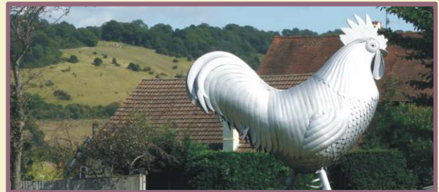
'DORKING' COCKEREL ON DEEPDENE ROUNDABOUT